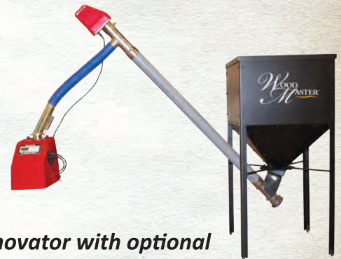
Renovator with optional pellet hopper