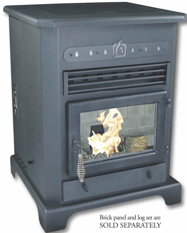
Brick panel and log set are SOLD SEPARATELY