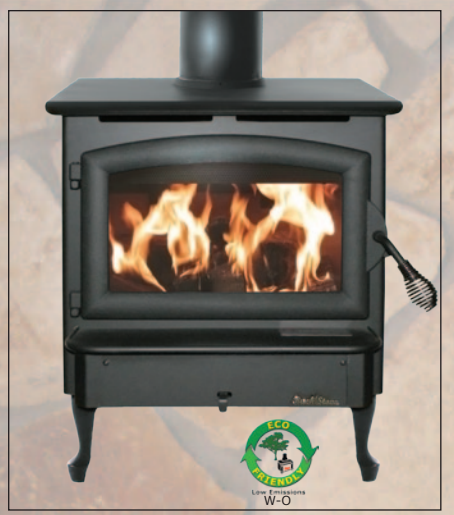
Model 21 is available as either freestanding or as a masonry fireplace insert. (Shown with Black options)