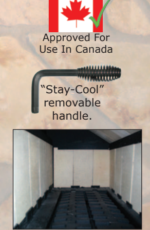
Deep, 24-1/2" Fully Brick Lined Firebox & Cast Iron Shaker Grates!