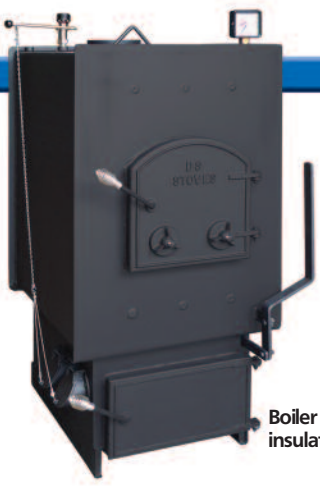
Boiler without insulation jacket