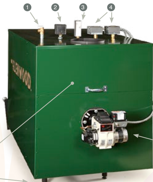
The Glenwood (back view)