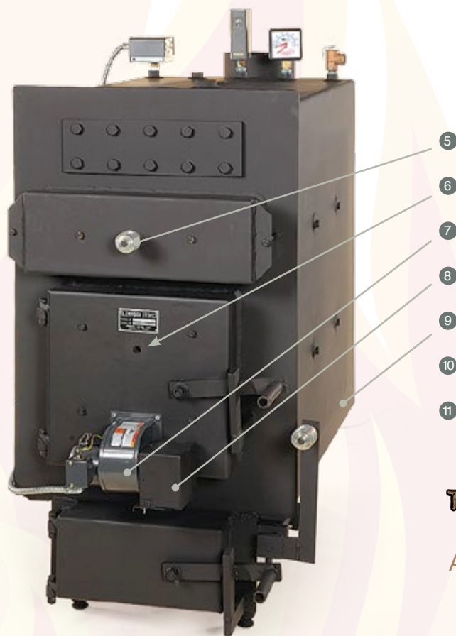
The Glenwood (without insulation panels)